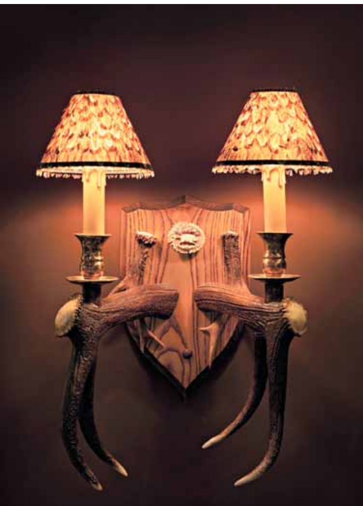
Clockwise from opposite top left: Seating area; Private room; Antler-flavored wall sconces; Fireplace; Mirror.

The space is divided into the main bar, lounge and a separate cigar lounge, which can be reserved for private meetings.